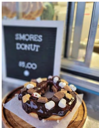
The S'mores Donuts